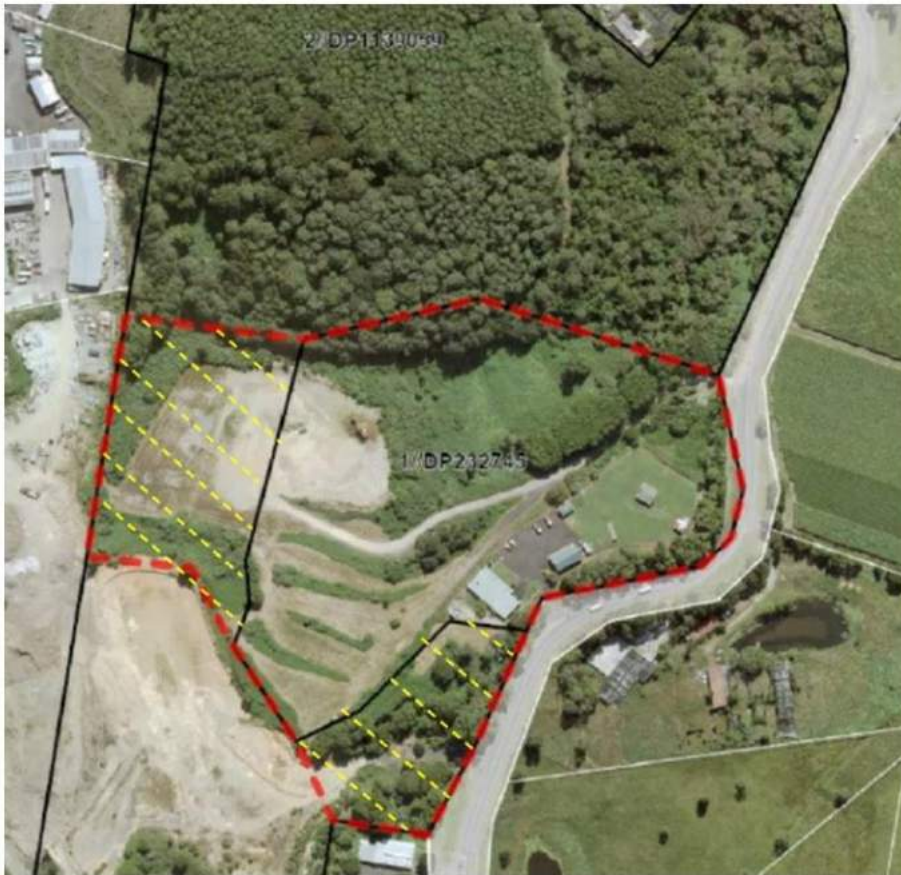
Figure 2: Proposed land zoning